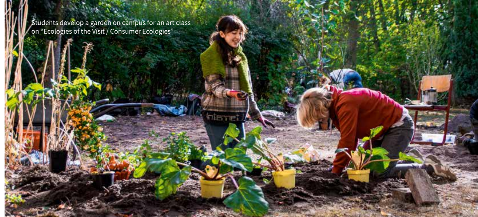
Students develop a garden on campus for an art class on "Ecologies of the Visit / Consumer Ecologies"

For further information on financial aid and scholarships please visit: https://berlin.bard.edu/admissions/finances/financial-aid/