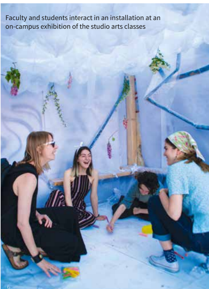
Faculty and students interact in an installation at an on-campus exhibition of the studio arts classes