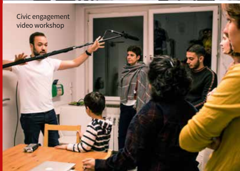
Civic engagement video workshop