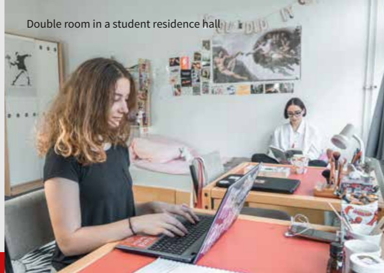
Double room in a student residence hall

Training in and completion of independent research related to major (fourth year)