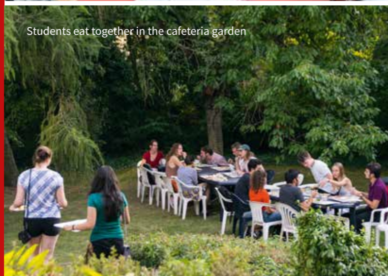
Students eat together in the cafeteria garden